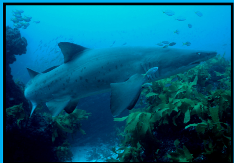
Clear, side-on photos like this one will allow Grey Nurse Sharks to be identified by their unique spot patterns.

More details on how to register as a site custodian, the methods manual, uploading images and the Grey Nurse Shark Watch database, are available on Reef Check's website: www.reefcheckaustralia.org .